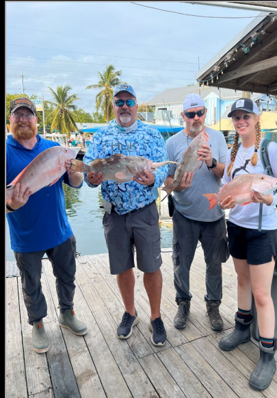
Successful fishing excursion in Key West