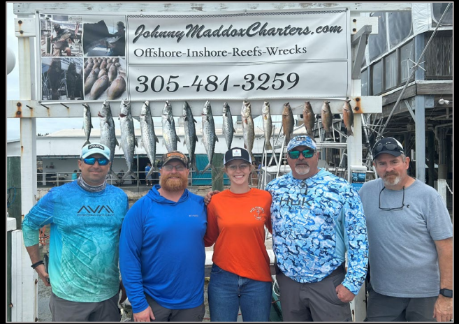
Key West Crew